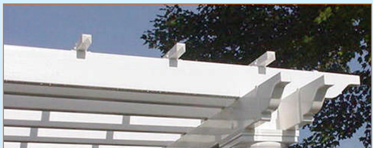
Balusters with Pyramid Caps