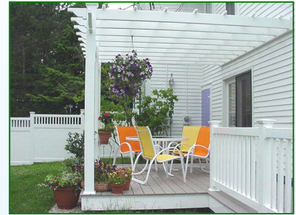
Attached to Structure