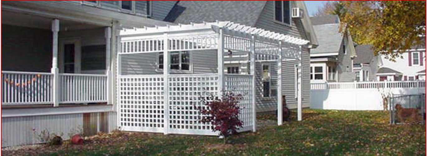
Pergola with Lattice Screen & Decorative Header

Railing, Lattice, Benches, Lighting Fixtures, etc. . .