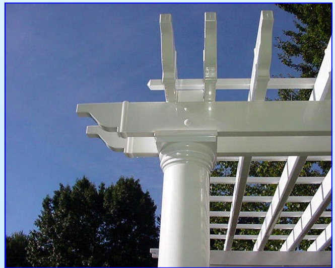
Double Beam With Round Column