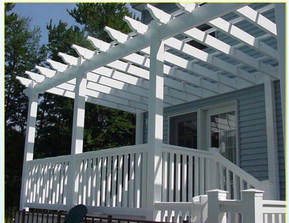
Pergola with Railing