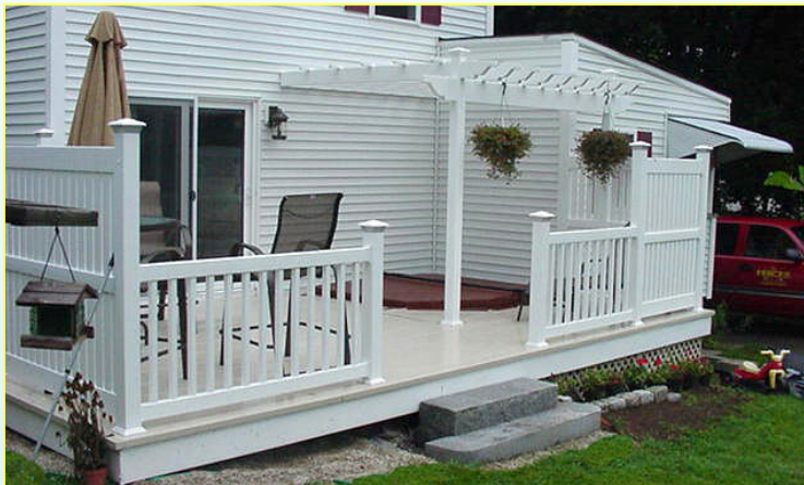
Deck with Privacy Fence & Pergola