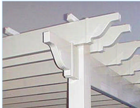
2" x 8" Beam, Routed Post