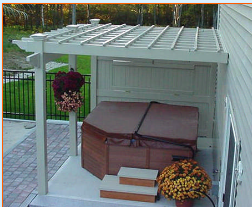
Typical Baluster Spacing