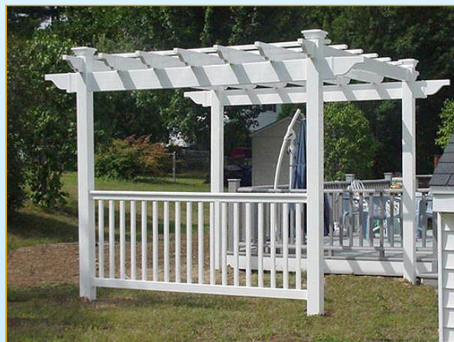
Freestanding Pergola with Railing