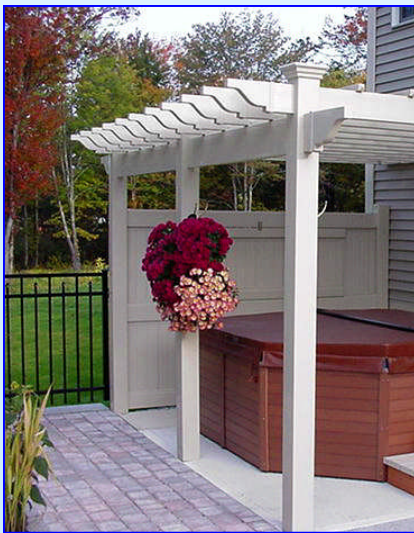
Square Post Routed for Beam