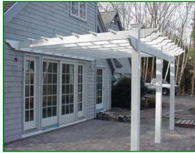
Attached to Structure